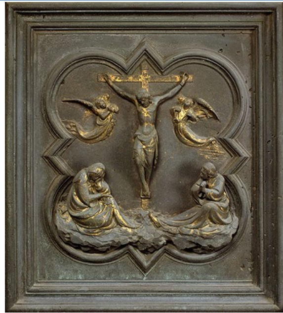
The Crucifixion by Lorenzo Ghiberti – Door of the Baptistry, Florence, Italy