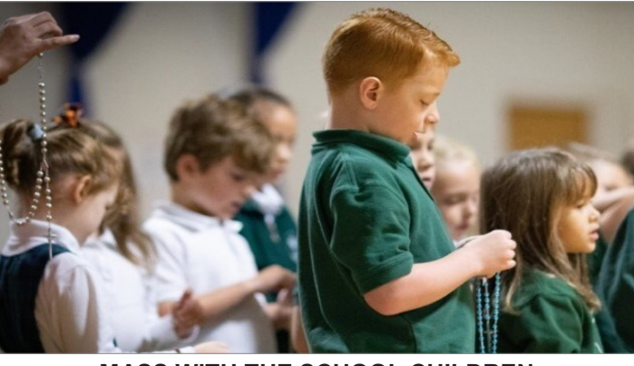
MASS WITH THE SCHOOL CHILDREN

Join us in the church for Mass with the school children. Thursday mornings at 8:45 a.m.