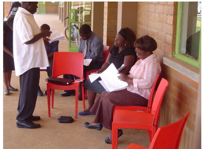
Sitting outside of Administration Block, Teachers are getting well briefed on First Day!

“Dreams are becoming realities” – 07 September 2015 was the First Day of enrolment for 144 girls and boys boarders coming in to Form One (Grade Nine) in our new Jesuit school in Malawi. Many, many thanks for all those who have made this possible! We will keep in touch with you – and you please keep in touch with us!