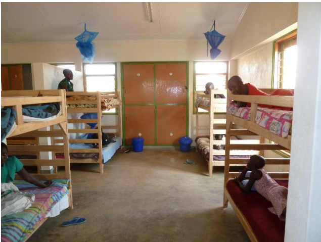
Moving in on First Day, girls try out bunk beds in Girls' Dormitory – very comfortable!