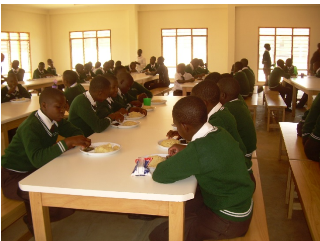
Good meals served and eaten in a good environment make for healthy and happy and students!