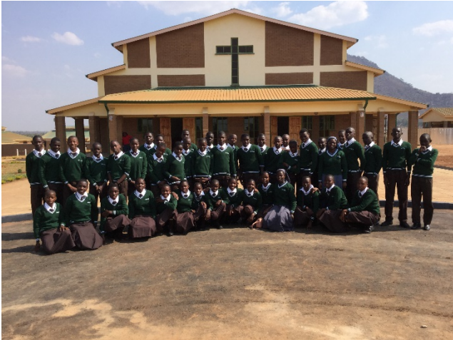
Form One girls and boys in front of Conference Hall on Day One – nice uniforms and big smiles!

“WE ARE OPEN, THANK GOD!” BIG SMILES, HIGH HOPES, MANY THANKS!