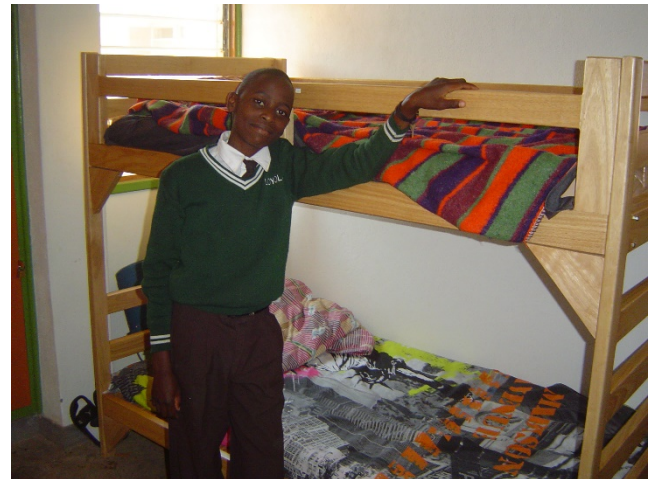
Boys' dormitories have good bunk beds for good sleep, well-rested students for another day of school!