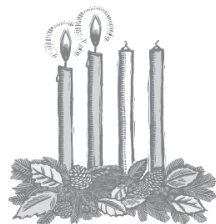
Second Sunday in Advent

RCIA Rite of Acceptance at 8:30 a.m. Mass